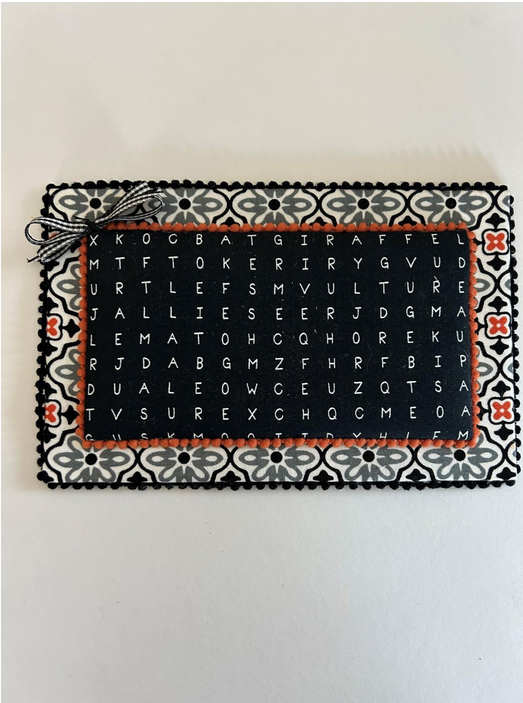
FINISHED PIECE WITH POMS AND BOWS APPLIED

lois mouriski bear lady dot creates 144 woodrow ave, ste 2 modesto, ca 95350 ladydotcreates@gmail.com