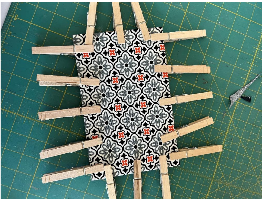
clothes pins in action #4

GO TO WWW.LADYDOTCREATES.COM and on the front page, print off and read the PDF regarding Pom Pom Tape Removal. It's absolutely the best and makes pom pom trim so easy... but be aware – only my brand is capable of this so be careful with other poms on the market – they will unravel and turn into a giant ball of polyester fluff.