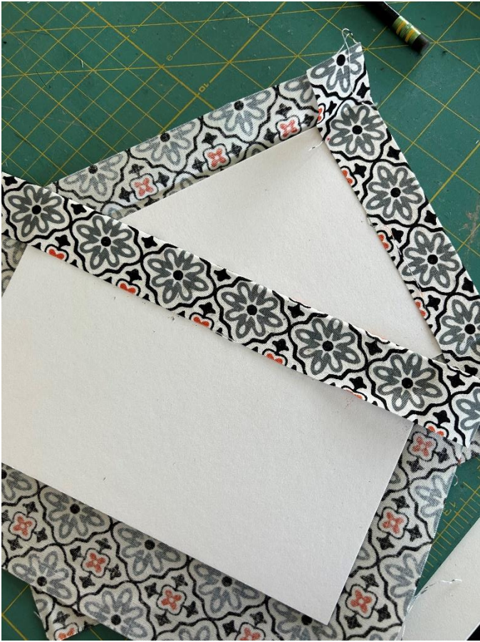
gluing backing fabric to both large boards #3 – see the opposite sides being glued.