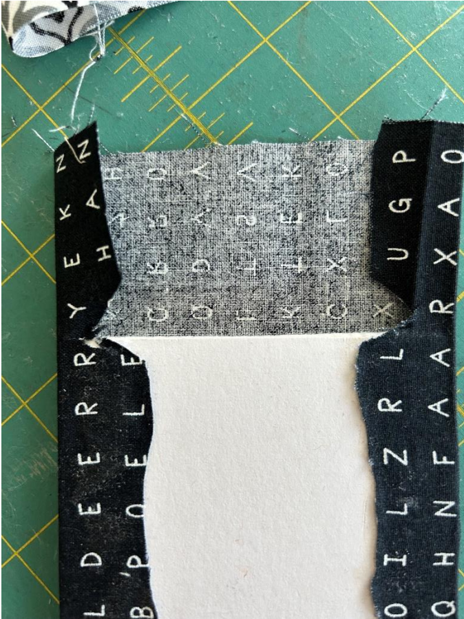
Removing excess linen/fabric from folds