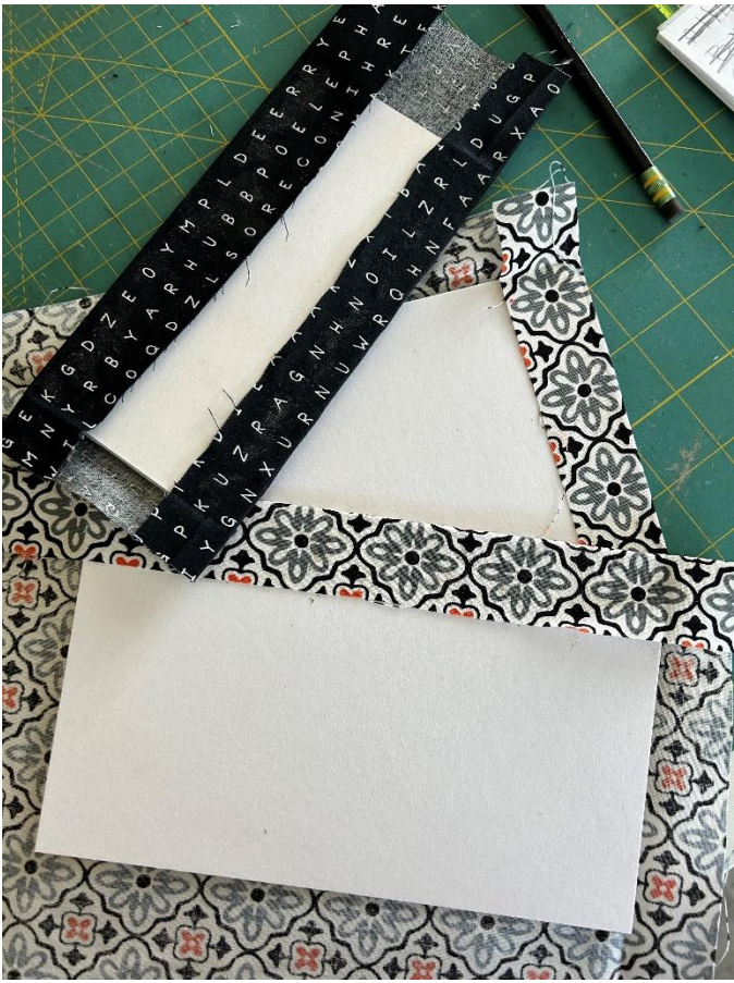
Small black alphabet represents your stitched piece #1